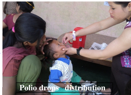
Polio drops distribution

were informed and radio announcement given.