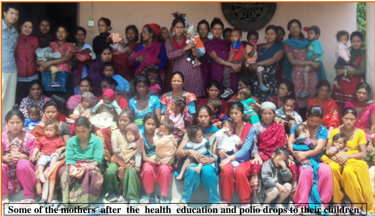
Some of the mothers after the health education and polio drops to their children

Giving two drops of life to insure that no child in brick kilns need ever suffer from the crippling disease of polio. Pamphlets were distributed with the aim to spread the health message to more mothers. It was so moving to look into these children's eyes and know that they will be safe from polio forever!